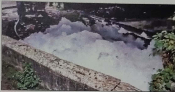
UNSAFE: Spread over 10.45 acres, Putheri lake channels overflow from Periya Eri to the Pallikaranai marshland through Keelkattalai lake and helps recharge groundwater in the area

Chennai: Residents of Pallavaram near Putheri lake woke up on Friday morning to find foam creeping near their homes, sparking renewed concerns over pollution, especially after the Tamil Nadu Pollution Control Board (TNPCB) declared the lake's water safe following a similar incident in Nov last year.